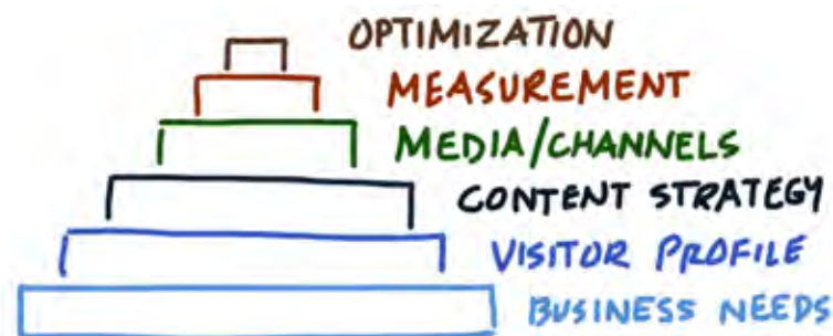
Figure 1: The Conversion Marketing “Stack”