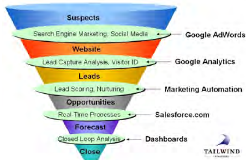
Figure 1 – Changes in B2B buyer behavior resulting from online buying and ubiquitous search frequently mean that sales bottlenecks are found higher up in the sales funnel. Marketing automation systems provide a foundation for a seamless “lead-to-opportunity-to-close” process across both the marketing and sales functions. Closing the loop from one end of the cycle to the other is a necessary first step for determining which marketing campaigns, lead nurturing and sales activities are working and which need improvement.

In effect, the once linear process of being led by a sales rep through a series of steps has now become a buyer-directed process driven by self-guided, online research. Buyers expect sales people to do all the adapting now and to instantly recognize their needs and adjust accordingly. How can Sales and Marketing work together to meet this new challenge head-on and improve success rates? The following best practices offer a good place to start.